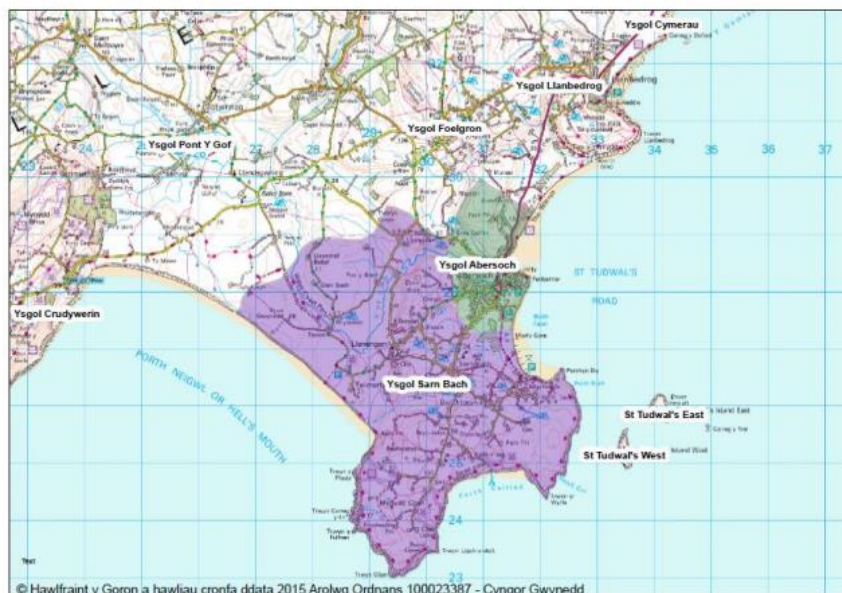
Map 1: Current situation of the area's catchment areas

If the proposal is implemented, the catchment area of Ysgol Sarn Bach would be adapted to include the area of the existing school, as well as the existing catchment area of Ysgol Abersoch.