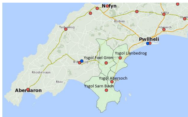
1 The locations of schools in the Abersoch area

The Ysgol Abersoch catchment area adjoins with the catchment area of 3 nearby primary schools, namely Ysgol Sarn Bach, Ysgol Foel Gron and Ysgol Llanbedrog.