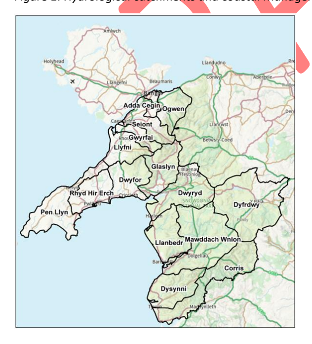
Figure 1: Hydrological catchments and coastal Management Areas within Gwynedd

To segregate the risk across Gwynedd and help identify the areas of most concern we discuss inland flood risk by main hydrological catchments, of which there are 15 in total. Coastal risk is described according to coastal Management Areas that have been defined within the Shoreline Management Plan (SMP2).