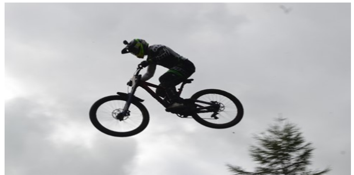
Biking event at Dinas Mawddwy

A significant part of the support available for businesses is provided on behalf of Welsh authorities by the Welsh Local Government Association. An officer from the Association visited the Council to provide an update to all Members on the guidance available, and an update was given by Council officers on the internal preparations for Brexit.