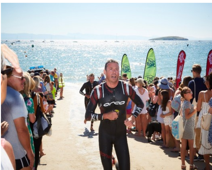
Triple Crown in Abersoch

Projects that currently receive support were scrutinised, and it was noted that all areas of Gwynedd were very active and in receipt of support for their activities.