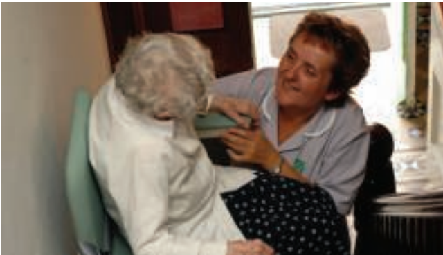
Helping older people to maintain independence in their own home.

“Making it easier for older people to live full and independent lives”