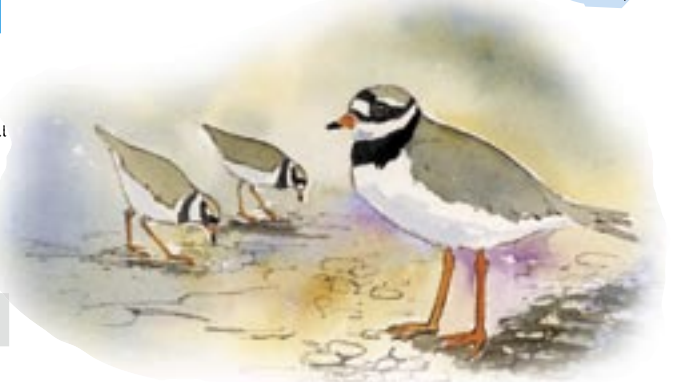
Cwtiaid torchog/Ringed plover