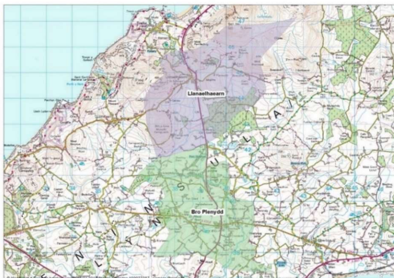
Map 1: Current situation of the area's catchment areas

In light of the proposal, Ysgol Bro Plenydd's catchment will include its own existing catchment area and the catchment area of Ysgol Llanaelhaearn.