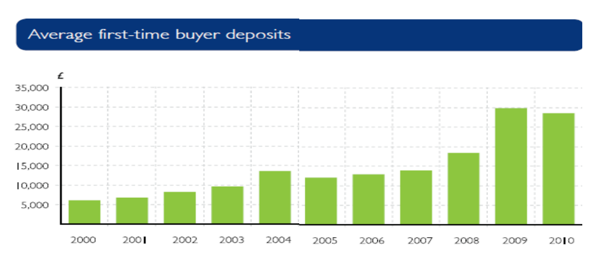
Table 1 – Average first time buyer deposits 2000 – 2010

1.8 Table 2 below brings together the latest information on the prices of different types of properties within the county.